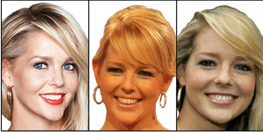
Figure 1. Example stimuli used in the experiment. Image attributions from left to right: MariskadG (Own work) [CC BY-SA 4.0], Rob van Hilten (Own work) [CC BY-NC-SA 2.0], Paul and Menno Ridderhof (Own work) [CC BY-NC-SA 2.0].