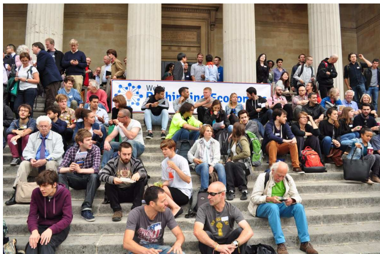
Participants of the conference, 28-29 June 2014

Last June the grandiose buildings of the University College London (UCL) saw economics students, academics and the interested public engage for a weekend in rethinking economics. The student-organised Rethinking Economics conference was launched last year and this was its second run in London. There was a similar event organised in Tübingen, Germany, in 2013 and another one will be held in New York later this year.