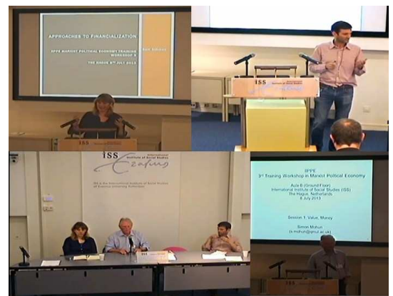
Images taken from the 3rd IIPPE training workshop which took place at the International Institute of Social Studies, the Hague, in advance of the 4th Annual Conference in Political Economy. Recordings of the sessions can be accessed from www.iippe.org

Since founding the organization in 2006, IIPPE members have been active in promoting pluralist economic education and political economy. IIPPE has organized seven successful training workshops, with the eighth taking place ahead of the annual conference in Naples this year. It is the aim of IIPPE to continue with the organisation of training workshops with greater participation of working groups in relation to particular themes and issues covered in future workshops. IIPPE is also in the process of forming a working group on education to take forward issues of training and curriculum development. This group will be conducting a roundtable discussion at the upcoming annual conference on challenges in and reflections of, teaching political economy.