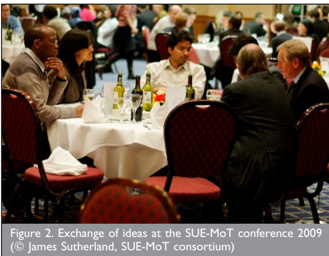
Figure 2. Exchange of ideas at the SUE-MoT conference 2009

Considering a triple bottom line approach, a sustainability assessment needs environmental impacts to be better known for