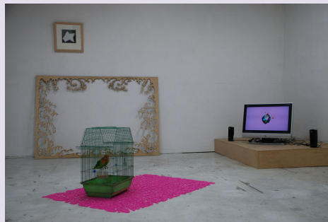
Fig.2. Dutton + Swindells, Installation with Lovebirds , Ssamzie Art Space Studios, Seoul, March 2008, Image courtesy of the artists.

experiments abandoned or paused part way through. Nascent activity cannot be differentiated from that which has already collapsed or become entropic; emergent forms remain indistinguishable from those already in ruins. Within this process, certain formulations stay or become refined whilst others are erased, swept away, forgotten. Badiou describes the various combinations submitted to enquiry by the 'subject' within a given moment of the generic procedure as the 'matter of the subject'. 13 Dutton + Swindells identify their 'matter' through a form of endless experimentation, the perpetual creation of situations to which they add new or unruly elements in order to attempt to rupture its status as count-as-one. The task becomes one of trying to locate the 'generic set' that cannot be counted-as-one (or perhaps remains wild ) within the terms of the existing situation.