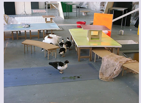
Fig.6. Dutton + Swindells, Studio Production with Ducks , Psalter Lane Studios, Sheffield, July 2005.

Dutton + Swindells insist that the categories which demarcate one thing from something else are often arbitrary and easily transgressed. However, rather than wanting to abolish such systems of classification—which are perhaps inescapable—they propose that these insidious modes of capture in fact might inadvertently produce the very conditions for an unexpected encounter with something incomprehensible or wild. Working within the logic of classification, their quest becomes one of pushing at the edges of one meaning whilst holding back the terms of another. They try to locate the fulcrum point where it is possible for something to appear momentarily unnamable or unclassified, no longer and not yet knowable. The challenge for the artists, however, is one of preventing these nascent assemblages or generic sets from being identified or