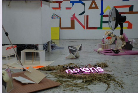
Fig.1. Dutton + Swindells, Studio Production , Ssamzie Art Space Studios, Seoul, February 2008.

Dutton + Swindells' practice takes the form of a series of lengthy and indefinite stages or processes, which are forever changing and mercurial. Resulting works are the residue of such an endeavour, however, it is the tactics themselves that constitute the work , the artists' faithful operation. For Dutton + Swindells, the space of the studio – which is in turn extended to the space of the residency – is the site of practice wherein a 'generic truth procedure' is played out. The habitually unseen activity of artistic practice operates analogously to Badiou's 'generic truth procedure' or 'the enquiring of the enquiry', where what is subsequently made visible through exhibition is perhaps that which is deemed most 'truthful' by the artists. This relationship between the 'enquiry' and its residue can be witnessed in the documentation of Dutton + Swindells' residency at Ssamzie Art Space [Figure 1]. The operational phases of activity are marked by their formlessness as the artists assemble, reassemble, combine and recombine innumerable elements in the hope of somehow rupturing the count-as-one coherence of the situation, of producing the unexpected anomaly of something 'indiscernible'. Familiar forms are worried until they begin to break down and recombine differently. Incongruent components are slowly reduced to exquisite distillations, unruly half-forms. Half-finished assemblages, strewn floors and walls, the scattered debris of past