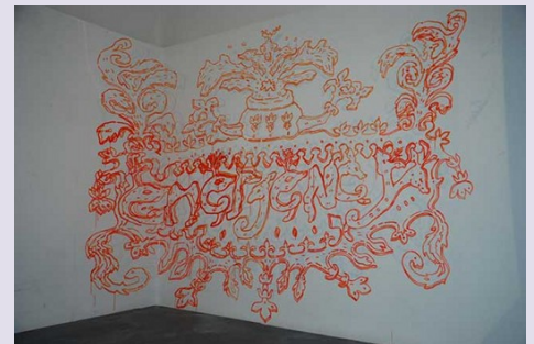
Fig.8. Dutton + Swindells, Emergency Text Wall-Drawing (in-progress), Huddersfield University Studios, February 2009.

In a manner similar to the way in which Badiou theorises the subject, Dutton + Swindells practice might be considered as a 'local configuration of a generic procedure'. 18 Here, art itself might echo or actually share the terms of Badiou's definition of the subject, as 'the local status of a procedure, a configuration in excess of the situation'. 19 The possibility of this shared definition (for both art + subject) perhaps implies an intrinsic