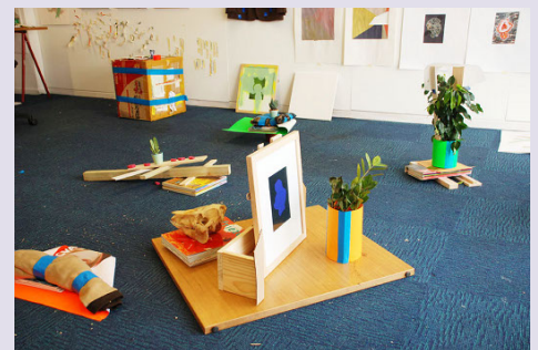
Fig.3. Dutton + Swindells, Studio Production with Plants , YASS Studio, Sheffield, March 2010.

For Dutton + Swindells, collage is used as a strategy for bringing things into proximity, to create moments of unexpected collision where two wholly unrelated things meet and acknowledge their difference, their unlikeness [Figure 3]. For Dutton + Swindells, 'the notion of collage is something that is in the throws of possible conflation while simultaneously maintaining a suspended and frozen position of indelible difference'. 15 Collage is a mode of contiguity rather than continuity; touching surfaces inevitably create a line that in turn reinforces the conditions of their separation. This line of separation is one of differentiation, marking the