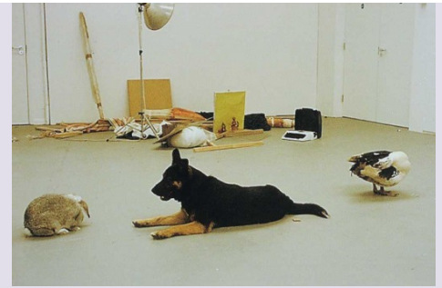
Fig.5. Dutton + Swindells, Studio Production with Dog, Rabbit and Duck , S1 Artspace Studios, Sheffield, July 2004.

For Dutton + Swindells, the event corresponds to an encounter with the wild – something unlike, unfamiliar or incomprehensible – which in turn has the capacity to breach or rupture habitual ways of being and thinking. The phrase 'beyond comprehension' is often used pejoratively, as an