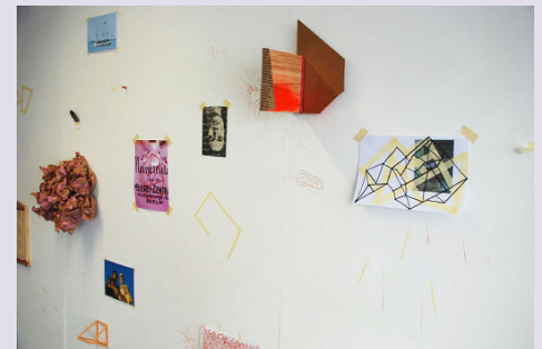
Fig.9. Dept. of Celestial Mechanics Wall-Installation (in-progress), YASS Studios, Sheffield, July 2010, Dutton + Swindells.

of perceptual flickering when it becomes possible (for both artists and audience) to see what cannot be seen, when it is possible to 'know' that something indiscernible is being encountered. The production of the blind-spot re-convinces the faithful (artists), at the same time as being a new form of event for prospective disciples, in turn producing the possibility of a faithful community . Here then, perhaps, within the terms of a truth procedure (taking the form of an art practice) the revelation of the generic set also has the capacity to be eventual.