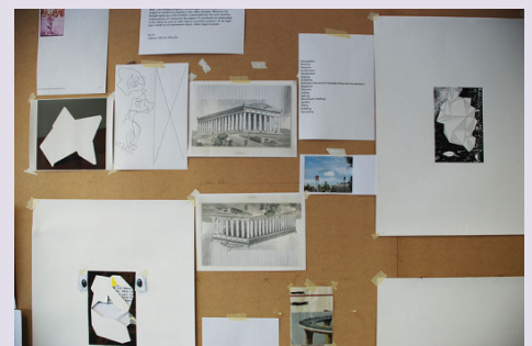
Fig.4. Dutton + Swindells, Dept. of Celestial Mechanics 2 Wall-Installation (in-progress), YASS Studio, Sheffield, July 2010. Image courtesy of the artists.

limits of one thing from the beginnings of another—the boundary that separates 'me' from 'you', from everything else, ad infinitum . One entity bumps into another, simultaneously attracted and repelled by the experience of contact. Meetings occur but there is no dialogue to be had, no common ground to be reached. Seams form points at which differences can be only registered, unable to be reconciled or resolved. In these terms, collage is considered analogous to the artists' mute encounter with the deer in the woodland. Two things come face to face and are rendered dumbstruck, impotent. Each remains unable to voice itself in any coherent manner, for its own language is inadequate for initiating the necessary conversation. What exists between is nothing —except perhaps the immeasurable void of dissimilitude, a wordless vacuum. Through collage, Dutton + Swindells create conditions analogous to this suspended mode of incommunicable proximity. They set up encounters between things in order to render them mute [Figure 4]. However, this deadlock is not one of resignation or despair, but rather it is from the experience of stalemate that the artists hope to force something else , some other way. Stalemate can be broken if one side of the struggle is prepared to give or yield, however by disabling the efficacy of existing power relations, Dutton + Swindells attempt to provoke or call an alternative logic (or ethics) into play.