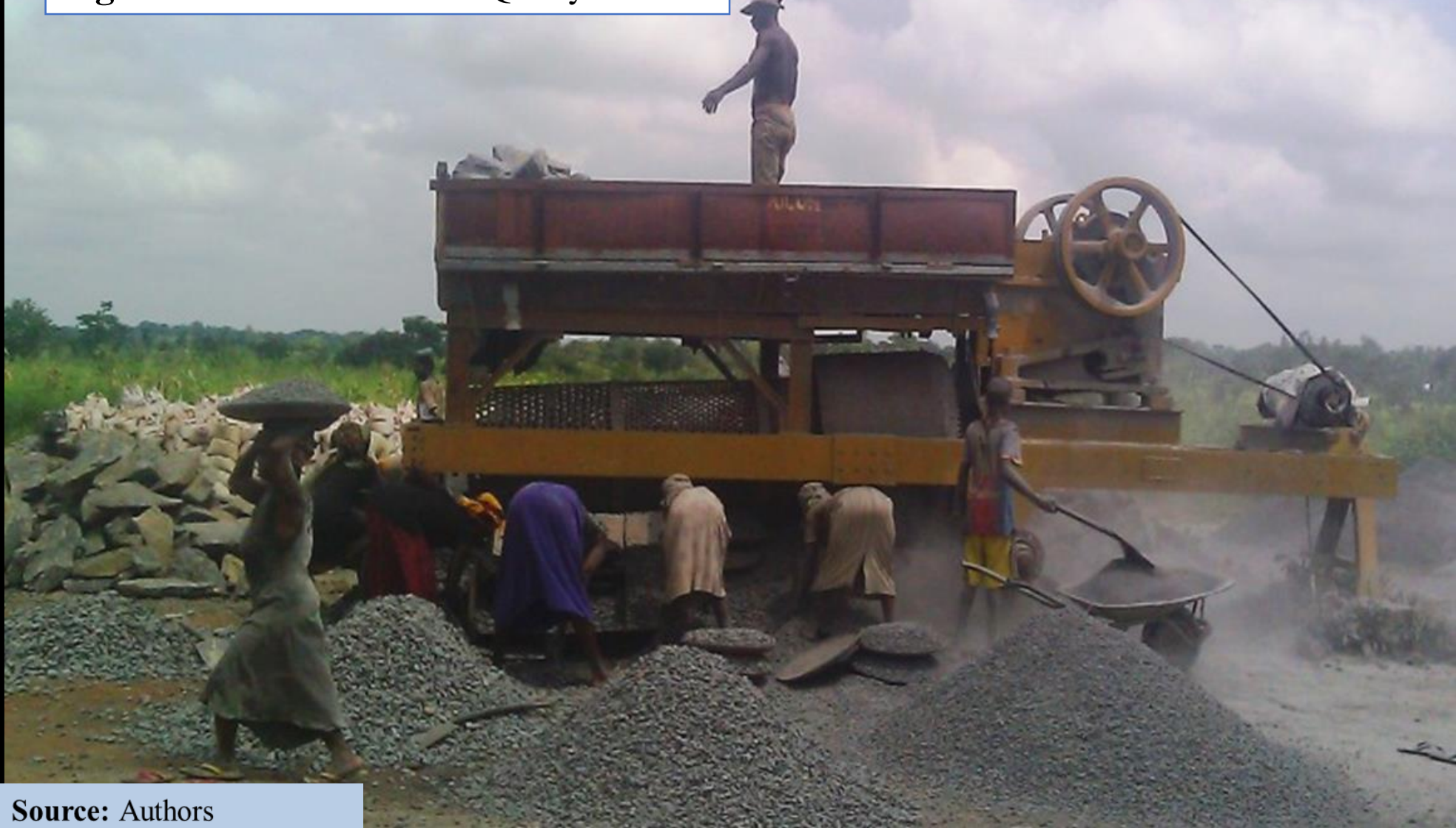
Figure 1: Jobs Creation at a Quarry Centre