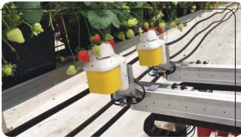
FIGURE 4 The two-arm strawberry picker mounted on the Thorvald platform.

generally viewed positively, with the behavior viewed as appropriate and safe. This was despite the participants having mixed views on robots in general, although they seemed less worried about the prospect of their work being directly replaced by robots, which is in contrast to an overall relatively negative view of robots in terms of job replacement reported in other areas of industry.