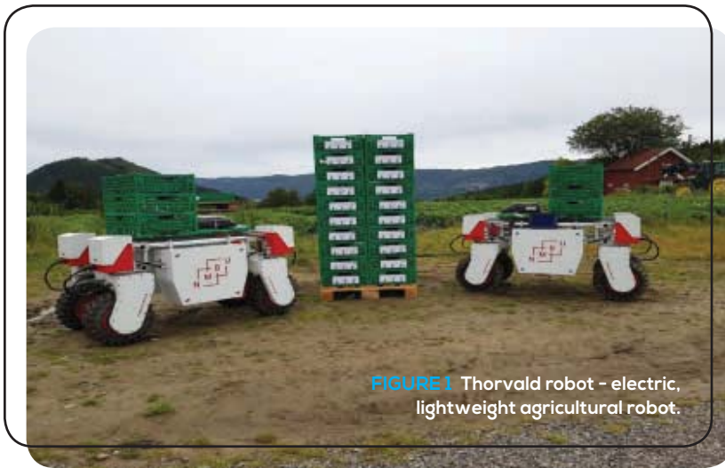
FIGURE 1 Thorvald robot - electric, lightweight agricultural robot.

robotic fleets in soft fruit production. The proposed system involves low-level motor control for robot actuators, but also intelligent control for safe navigation of individual robots and finally the coordination of the entire fleet. Many of the control aspects involve not only direct information provided by sensors, but also the learned representations of the environment and intelligent interpretation of its state illustrating the complex requirements faced by control systems deployed in the agricultural domain.