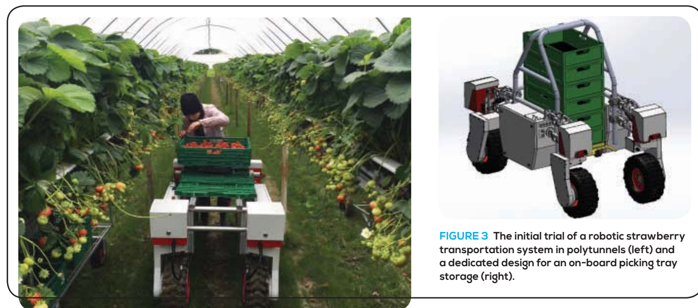
FIGURE 3 The initial trial of a robotic strawberry transportation system in polytunnels (left) and a dedicated design for an on-board picking tray storage (right).

Safe and effective interaction of the robotic platform with human workers is of paramount importance in the agricultural domain. Therefore, the project will develop appropriate techniques for the detection of humans and the characterisation of their behavior such that the use of appropriate interactive strategies can be employed. Human-aware navigation will ensure that the humans are treated not just as obstacles, but as interactive agents with intentionality. This will improve the general safety of operation. Human-appropriate means of coordination and communication with the robot will ensure that the intentions of the robot are