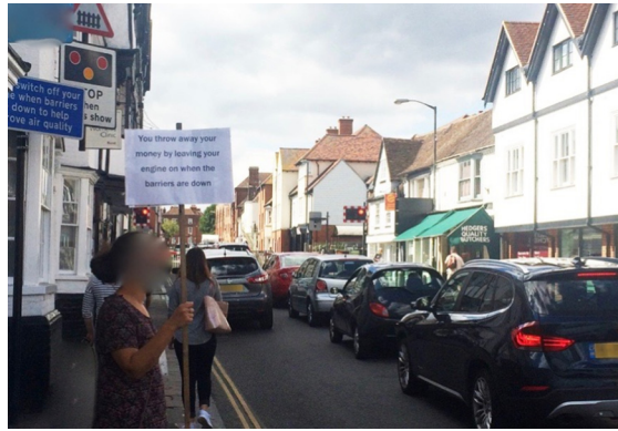
Fig. 1. Level crossing context. The white placard depicts the financial intervention. The blue placard depicts the permanent local authority sign. The permanent local authority sign reads: “please switch off your engine when barriers are down to help improve air quality”. (For interpretation of the references to colour in this figure legend, the reader is referred to the web version of this article.)

Financial, Health, Kin, Control) across barrier drop and direction of approach to the barrier. Barrier drops lasted on average 2.63 min ( SD = 0.79 min), barriers dropped approximately four times per hour during the day, and a mean of 30 cars were sampled per barrier drop. Across days of testing, we randomly varied the time that data collection took place in order to reduce the chance that the same driver would be sampled more than once (e.g., while commuting to work), and so that intervention conditions would not be confounded with the time of testing. We also coded the weather condition (rainy or clear) on each trial.