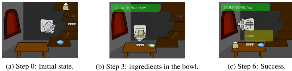
Figure 1: Sophie’s kitchen, the environment used in the study in three different states.

Study setup The study involves 40 participants (age M=25.6 , SD=10.09 ; 24F/16M) divided into two groups. The first group interacts with IRL and the second one with SPARC. Participants first teach the robot how to complete the task and then a testing phase, where participants’ inputs are disabled, evaluates the robot behaving on its own to assess participants performance in teaching. To limit the study time, a hard limit of 25 minutes for the teaching phase has been set for both systems, but participants could move on to the testing whenever they desired.