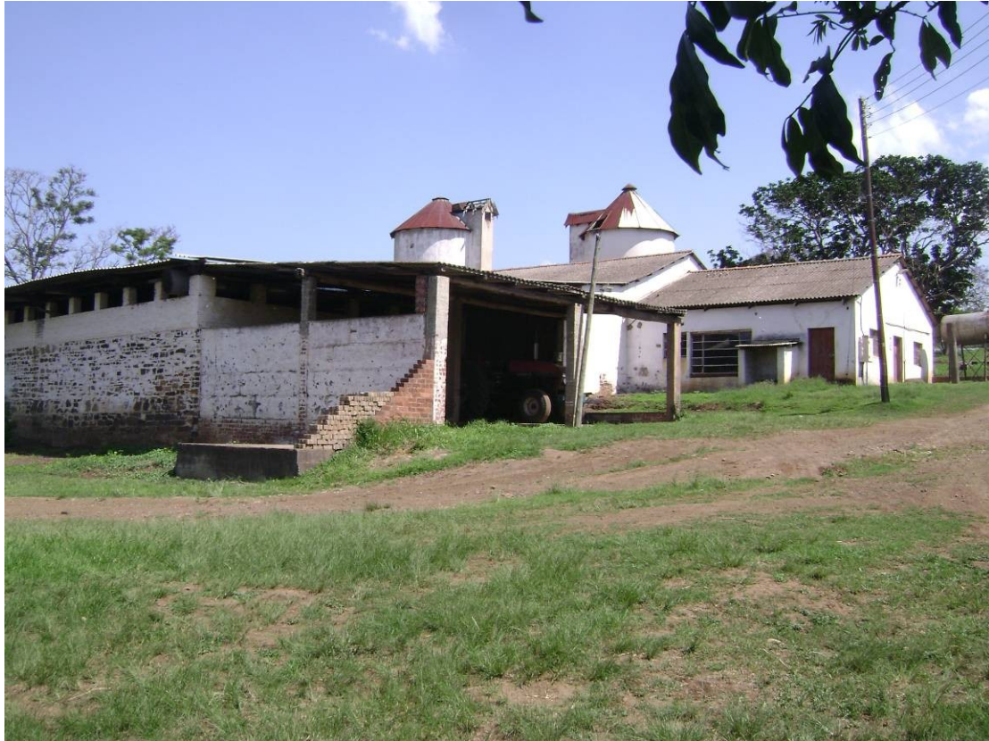
Fig: Showing site from north (Author 2010)

Prepared for: Archaeological Tourism & Resource Management PO Box 102532, Meerensee, KwaZulu-Natal 3901 November 2010