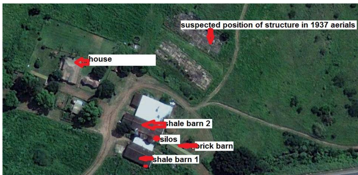
Fig 1: Site layout showing buildings of concern

Fig 1 above shows the site layout and the structures of concern. It is related to Fig 2 below, in that the latter is the aerial photograph from 1937 showing the farmstead as it stood then.