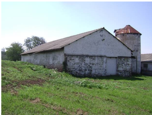
Figs 5 and 6: The covered space between shale barns and Barn no 1 with a silo behind