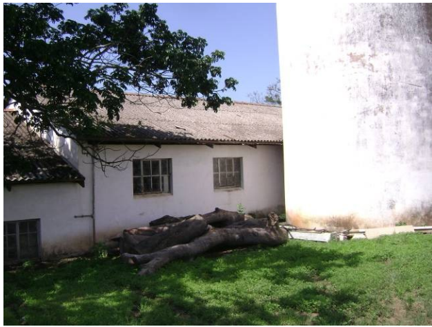
Figs 5 and 6: Showing grouping of silos, barns 1 and 2 and brick barn, and extended portion of barn no 1 with silo in foreground