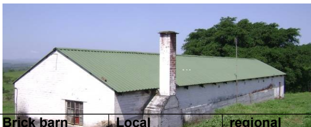
Figs 7 and 8: Showing the old brick barn: the portion towards the trees is in English bond suggesting that this portion was pre- or immediately post- World War II.

This structure is of painted brickwork in English bond under a corrugated sheeting roof. It is suspected that it dates to pre-1950. It forms part of a group together with the shale barns. It has certainly been extended to the north-west since its original construction.