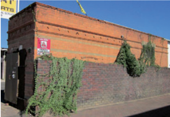
Figure 6: Boshoff Street Substation