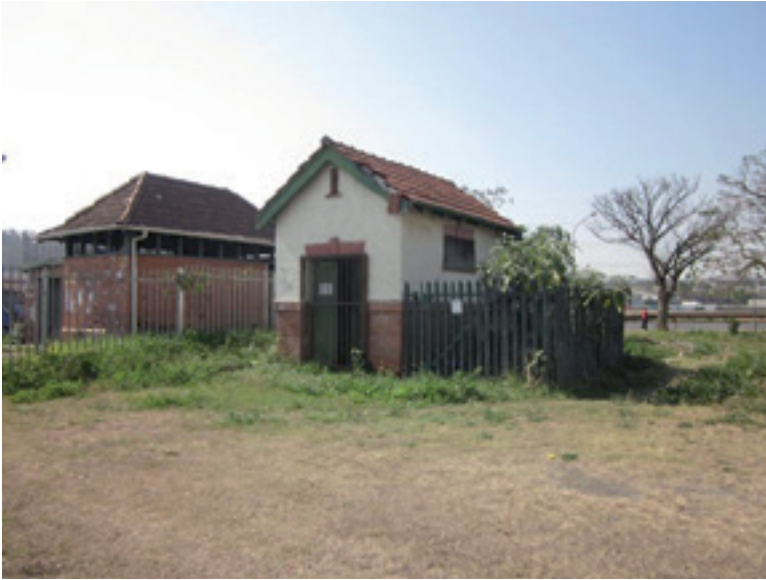
Figure 9: East Street substation and associated public toilets, late 1930s