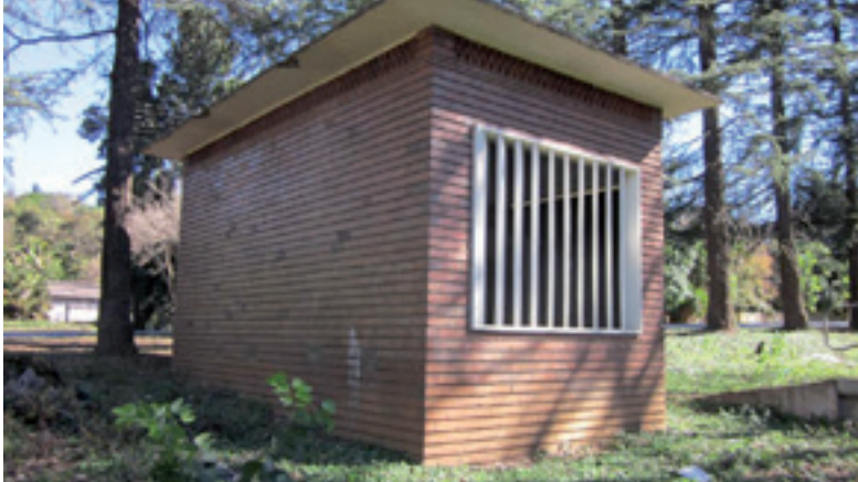
Figure 10: Substation – Sweetwaters Road, possibly designed by Noel

have become patterns in themselves: they have precedent and in themselves create precedent.