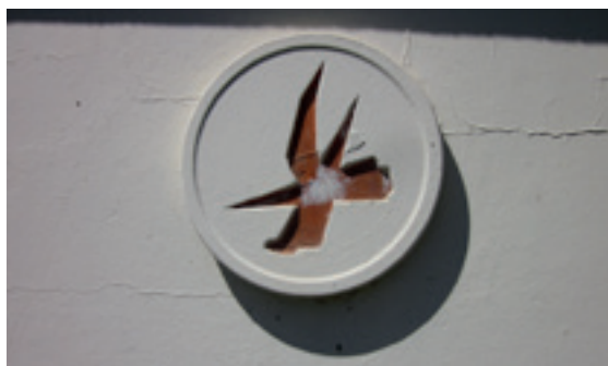
Figure 4: Running man

Whilst the aforementioned “Assisted Wiring Scheme” formed a fundamental part in the development and popularisation of electrification in the city, a means by which people were made aware of its dangers was also being formulated, namely the branding intended to signify “beware”. One of the earlier examples, known colloquially as the “Running Man” depicts a spiky individual with a pointed hat. This was replaced by the distinctly Modernist example from the late 1950s with the characteristic “lightning bolt” as a mutually understood signal of danger. 40