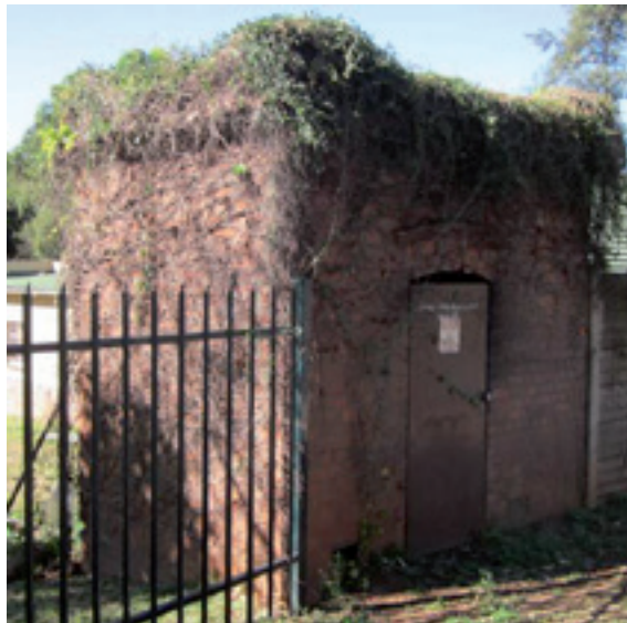
Figure 5: Prestbury Substation

However, the architectural response of these structures is purely instinctive: precedent did not exist in the city for housing this new form of technology. Certainly, in their “pattern” response, it is suspected that the design and construction was purely paradigmatic: this approach meant that these buildings automatically fitted in with their surroundings and blended in with their context, making them silent participants in the city-scape.