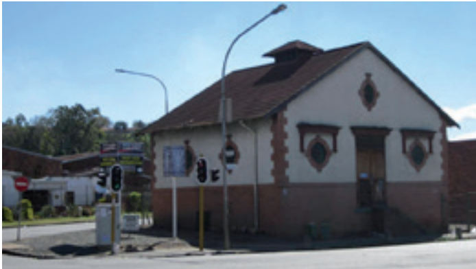
Figure 7: Victoria / West Street Substation ca 1926, perhaps designed by EB White

Thus, perhaps because of White's input, and despite the gradual stamp of Afrikanerdom becoming more prevalent in the rest of the Union, Pietermaritzburg Corporation's version of Union Period architecture remained quintessentially English, its vernacular origins retaining the stamp of the Victorian with elements of the Union period, without embracing a Cape Dutch Revival aesthetic common to other areas.