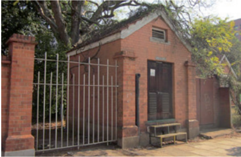
Figure 8: HE White's Longmarket Girl's School Transformer station – 1931

laying, and great emphasis placed on the quality and proportion of mixes. 48