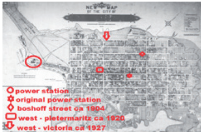
Figure 1: Annotated Secadanari Map, 1906. Note the Electrical Power Station as the dark spot to the left of the city (annotations Author 2014)

Source: D Secadanari, New map of the city of Pietermaritzburg, 1906 .