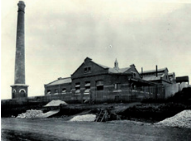
Figure 2: Pietermaritzburg Power Station (KwaZulu-Natal Archives Repository)

Source: KwaZulu - Natal Archives Repository also J Laband and R Haswell (eds.), Pietermaritzburg 1838 – 1938. A new portrait of an African city (Shuter & Shooter, Pietermaritzburg, 1988), p. 144.