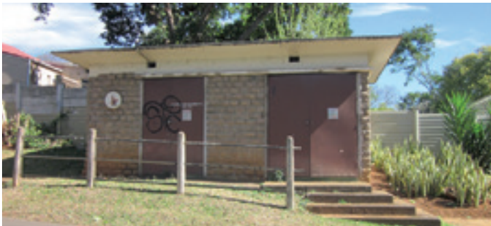
Figure 12: Centenary Road Substation, ca 1952

Finally, disguise was not always verdant. The first substation at Woodhouse and Riverton Roads appears to have been “semi-submerged” and a fully underground version was constructed at the corner of Centenary and Roberts in August 1941. Seemingly these two variants have disappeared: shortly after its construction, records note that a new substation was needed in Centenary Road, since the submerged one had reached capacity. Known as the “De Villiers Drive” substation, concern about the aesthetics was raised, and it was suggested that the harsh lines could be mitigated with the addition of stone setts which were lying unused in the Municipal Stores. This has resulted in what is a uniquely dressed substation in the city, almost reminiscent of a Herbert Baker tradition.