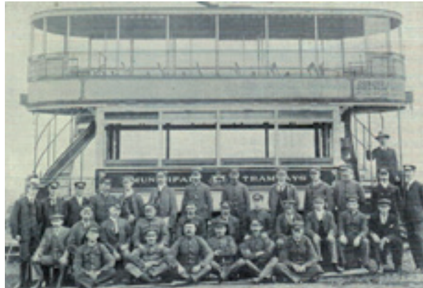
Figure 3: “A new type of tram” 26