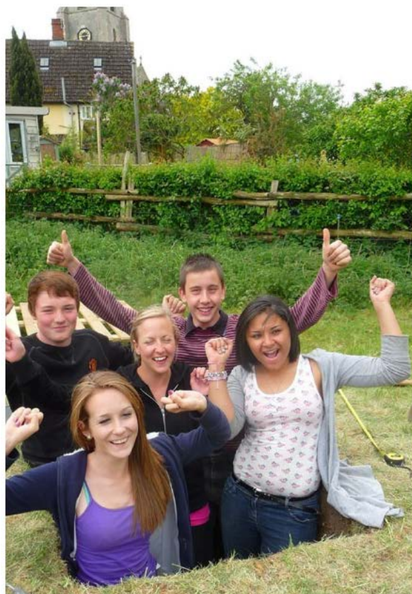
Figure 5: Caption: HEFA learners celebrate their test pit excavation in Coddendam, Suffolk

Data pertaining to the impact of HEFA have been presented in detail elsewhere (Lewis 2011; Lewis 2014b), but can usefully be summarised here as it is of course highly pertinent to the argument that the robust assessment system used on HEFA achieves its aims of raising aspiration, boosting confidence and developing skills. Feedback from more than 2,000 HEFA learners by 2011 (Lewis, 2011; 2014b) and more than as many again between 2012-16 (Lewis, 2014c; Lewis, 2015) consistently shows the impact HEFA has on the number of learners intending to apply to university: in 2005-11 the number definitely considering university rose by 26% when ‘before and after’ figures are compared, with 78% of all students confidently seeing higher education part of their future after HEFA and only 4% rejecting this (Lewis 2014b, 303-4). In some areas the impact is even higher: in October 2015 in rural Lincolnshire (a county where HE progression drops in some areas below 10%), the number of learners intending to apply to university was raised from 60% to 95%. Equally important is the impact HEFA has on attitudes to university, and here feedback shows that around 84% of participants in 2005-11 felt more positive about going to university after HEFA than before (Lewis 2014b, 303-4).