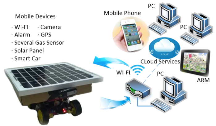
Fig. 1: In this figure, smart monitoring car on the left is shown as one type of mobile sensing nodes, which is developed by IWSNLab. This smart car is equipped with various sensors, e.g., CO, SO 2 , H 2 S, humidity, video and audio sensors. It is connected with control platform and remote server for controlling and comprehensive on-line monitoring in petrochemical plants.