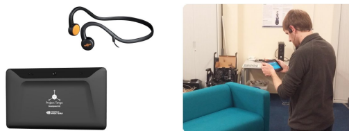
Figure 1: The navigation system components and its application.

The UK’s Royal National Institute for the Blind (RNIB), a leading organisation in the area, has identified a number of challenges for the modern VI person. These include the latter’s ability to safely and independently use public transport and navigate in unfamiliar environments (RNIB 2016). Recent technological advances allow for the creation of new solutions to address these challenges. GPS technology, for example, has become almost ubiquitous in the developed world. However, its accuracy is quite low – typically a few meters –, is notoriously inaccurate in urban environments where satellite signals are blocked by high-rise buildings and have unreliable availability indoors. GPS-based devices are therefore unsuitable to identify and direct a user to high resolution targets such as a building’s entrance or lift. To make a navigation system capable of successfully directing users to their desired location involves creating a system that can both localise the users within the world, i.e. by visually pro-