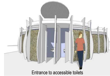
Entrance to accessible toilets