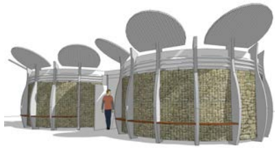
Entrance to changing rooms