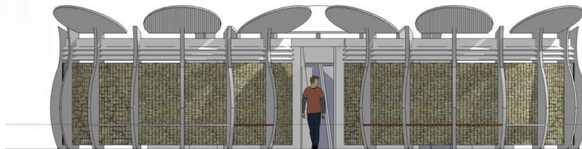
ELEVATION TO PLAYING FIELDS