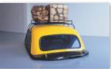
Top 13 India Arty Dos This January