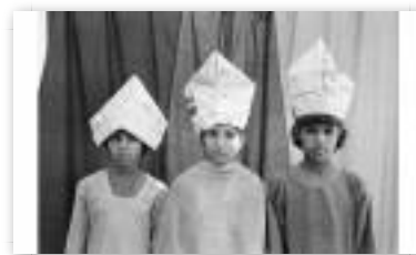
Gauri Gill's New Book is a Chapter on the Art of Portraiture