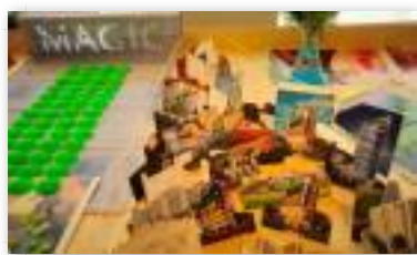
Raqs' "Reverse Engineering" Scrutinizes How Love Leads to Consumption and Fear F