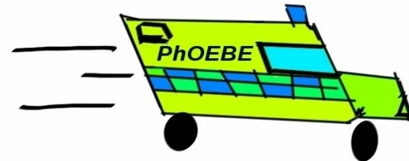
Pre-hospital Outcomes for Evidence Based Evaluation

This presentation presents independent research funded by the National Institute for Health Research (NIHR) under its Programme Grants for Applied Health Research (PGfAR) scheme (Grant Reference Number RP-PG-609-10195). The views expressed are those of the authors and not necessarily those of the NHS, the NIHR or the Department of Health.