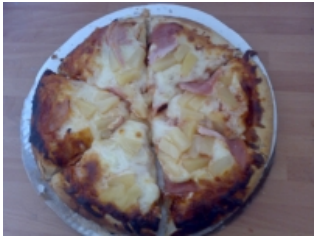
Figure 1. Examples of some images uploaded by participants.

We propose that a similar model of data analysis may be ideal for augmenting photographic food diaries. Specifically, users may tag uploaded food image content in the same way that players of The ESP Game and Peekaboom tag image content. This model is both novel within dietary interventions and is highly scalable, since additional users necessarily provide the system with additional processing power.